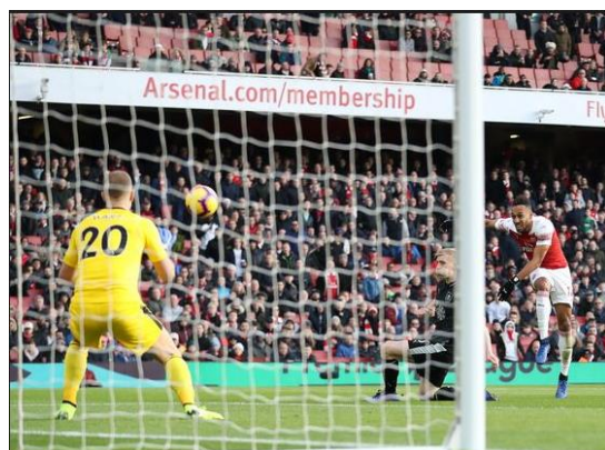
Aubameyang Thunders home against Burnley