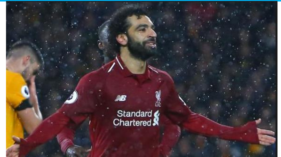
Salah Celebrates his goal against Wolves