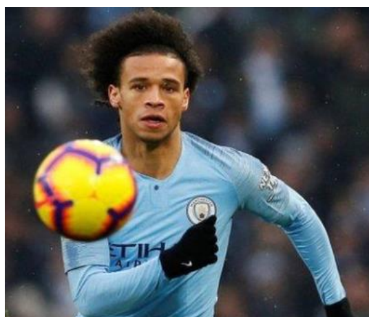
Sane moved to 7 assists for the season