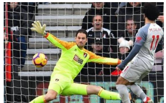
Salah hit a hat-trick against Bournemouth to score 21 points