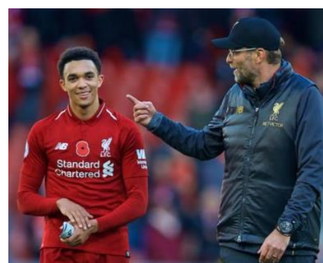
Klopp shows an appreciation for Alexander-Arnold 11 Fantasy pts