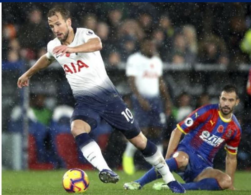
Kane in action against Palace a vital 10 points scored