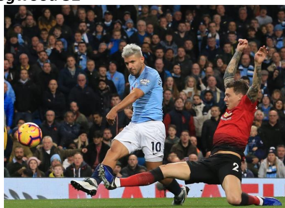
Aguero's goal against United