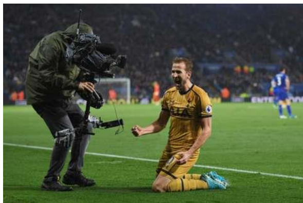
Harry Kane Four!!