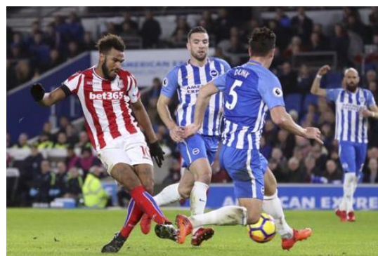
Chuopo-Moting scores against Brighton