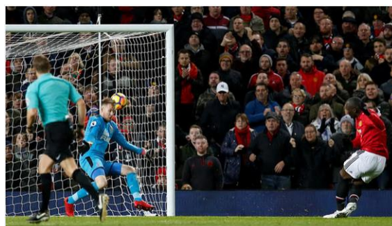
Lukaku scores against Newcastle